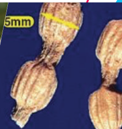
Photo 1: Ramenas seedling in cotyledon stage Photo 2: Ramenas seedling with first two true leaves Photo 3: Ramenas seedling 3.5 leaf stage Photo 4: Ramenas seedling 6 leaf stage Photo 5: Ramenas flower Photo 6: Ramenas pod